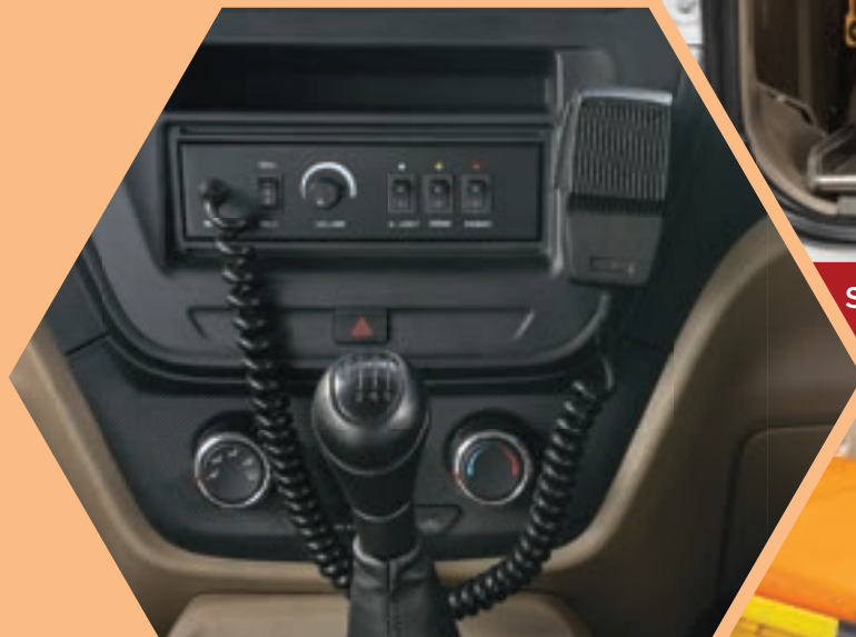
Public Announcement System & Two-Tone Siren