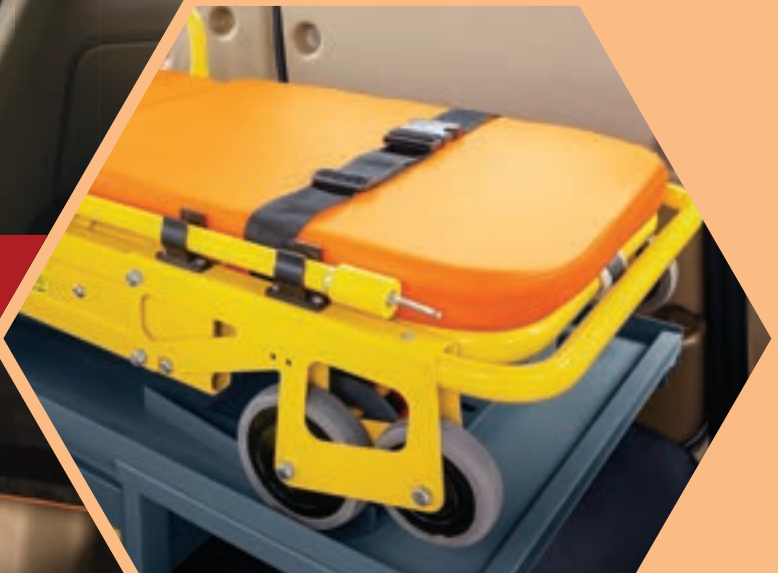
Lightweight, Cushioned Aluminium Foldable Stretcher