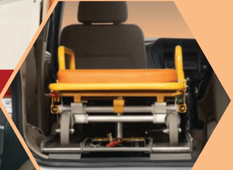
Single Person Operable Stretcher